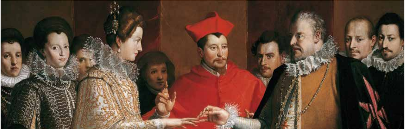
The proxy wedding of Maria de' Medici and Henry IV King of France (detail), Jacopo Chimenti, 1600 Florence, Uffizi Gallery

(Sweet Triumphs and Fine Pleating: sugar sculpture and folded napkins for the Florentine wedding of Maria de' Medici)