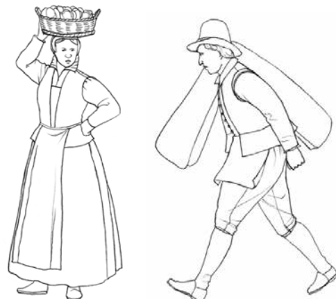
The pudding seller and mat seller redrawn by Michael Perry from the earliest set of Cryes of London © The Tudor Tailor

It is intended to cross reference the apparel shown in the images with other sources also an examination of the roles, duties and likely incomes of the protagonists will be of use in determining the verisimilitude of the representations.