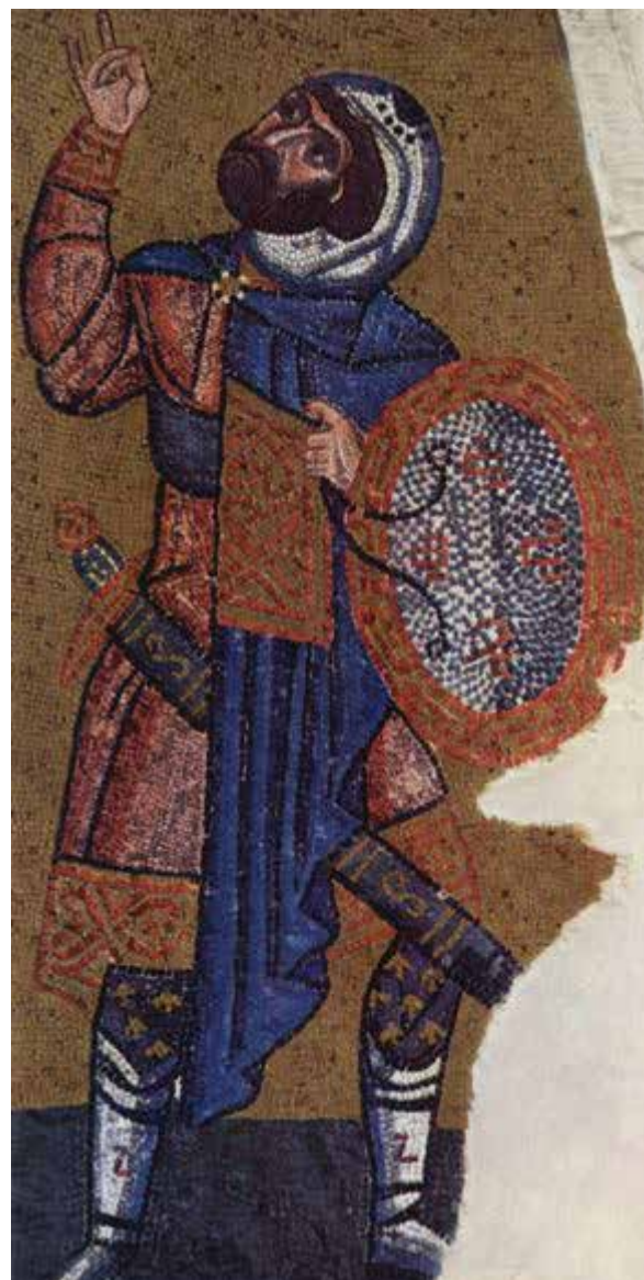
Longinos the Crucifixion Centurion as depicted in the Church of Nea Moni on the island of Khios

A fuller explanation may be found in the forthcoming volume By the Emperor’s Hand , to be released by Pen and Sword Books in September.