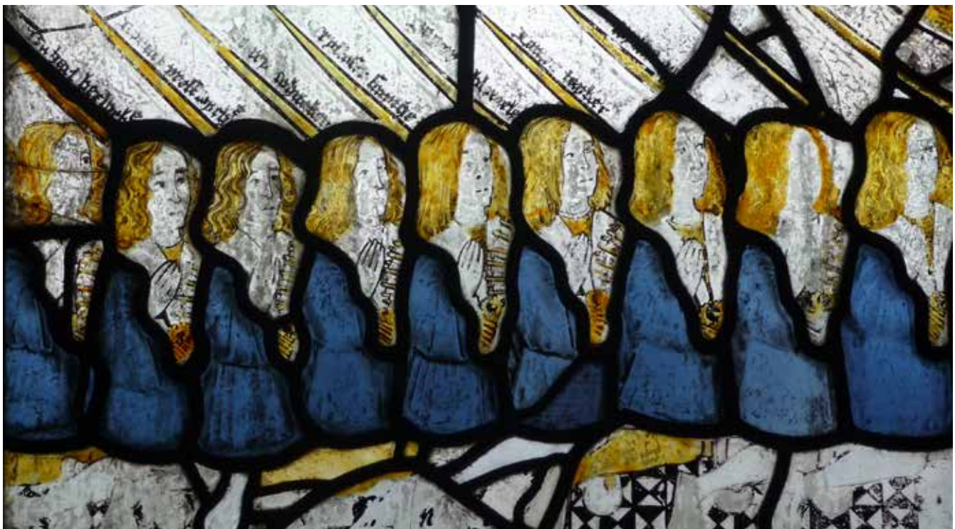
Sir Richard Assheton's liveried bowmen commemorated after the battle of Flodden (1513), at St. Leonard's Church Middleton, Lancashire.