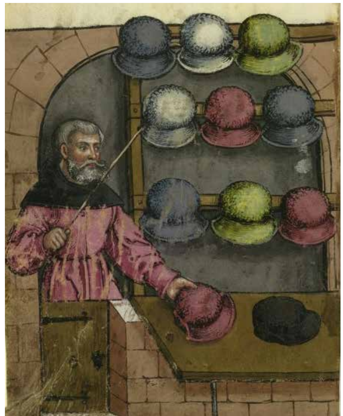
Brother Hans Eckel: Landauer I, 1533; Stadtbibliothek Nuremberg, Amb. 279.2°, fol. 22r

The images of the "Housebooks" are an important source for late medieval and renaissance life.