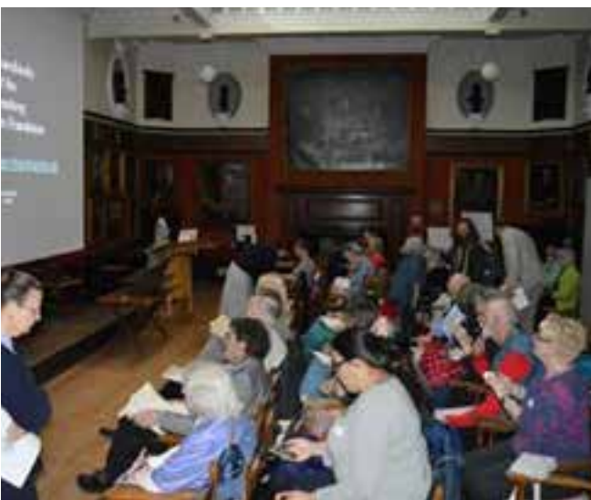
Delegates at the Occupational Dress conference at The Art Workers' Guild, London in May 2015

To receive the newsletter as a colour PDF file electronically, please e-mail medatseditor@hotmail.co.uk